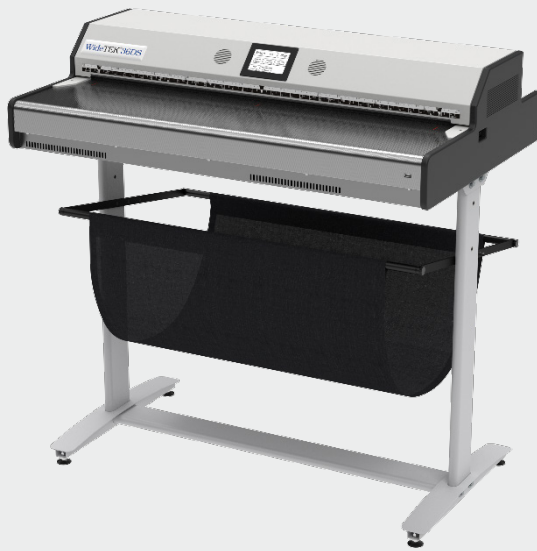
Side view of the WideTEK® 36DS with document collection basket. Scan stacks of newspaper pages without having to collect them each time they go through.

The scanner features two camera boxes, both consisting of three CCD systems, integrated into the upper and lower part of the device. WideTEK® 36DS captures both sides of the newspaper at the same time. After scanning, software separates the scanned document into four single images, capturing the left and right half of the front and back of the newspaper - everything in one single step.