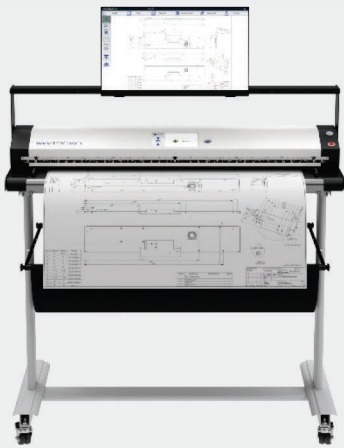
Large documents like maps rewind to the front or fall into the paper catch.

The WideTEK® 36CL produces extraordinarily sharp images, with color accuracy even superior to competing CCD scanners. Document rotation is done on the fly, a scan of an E-sized / A0 document in portrait mode at 300 dpi in 24bit color takes less than 7 seconds to scan and another 2 seconds to crop & deskew, preview and store.